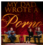
My Dad Wrote A Porno